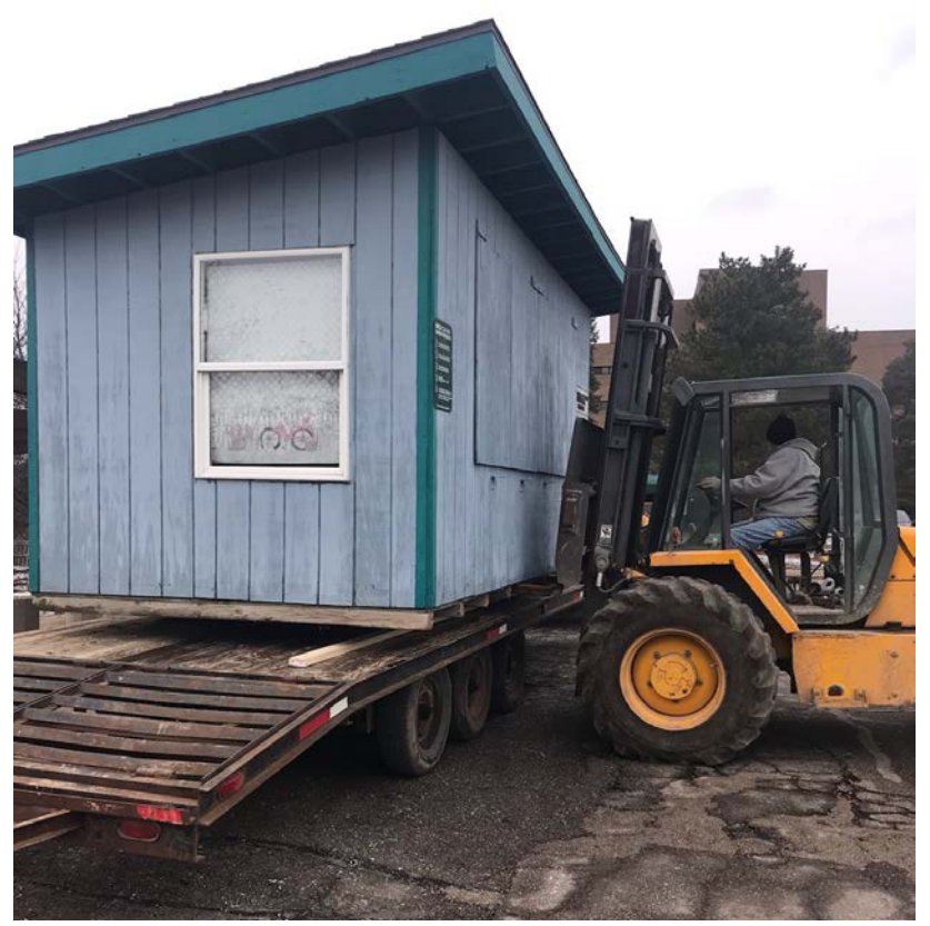
The old blue garden booth being taken away in January 2019 to make room for a new sidwalk and new booth!

The completion date for all of this work is scheduled for August 1st (fingers still crossed). So when you visit the gardens this summer be patient with parking. We are told that half of the lot will be accessible most of the time. If not, signage will redirect you to another nearby lot. All of us here are very excited for this new and updated parking lot and safe passageway walk to be completed. We hope you will be too!